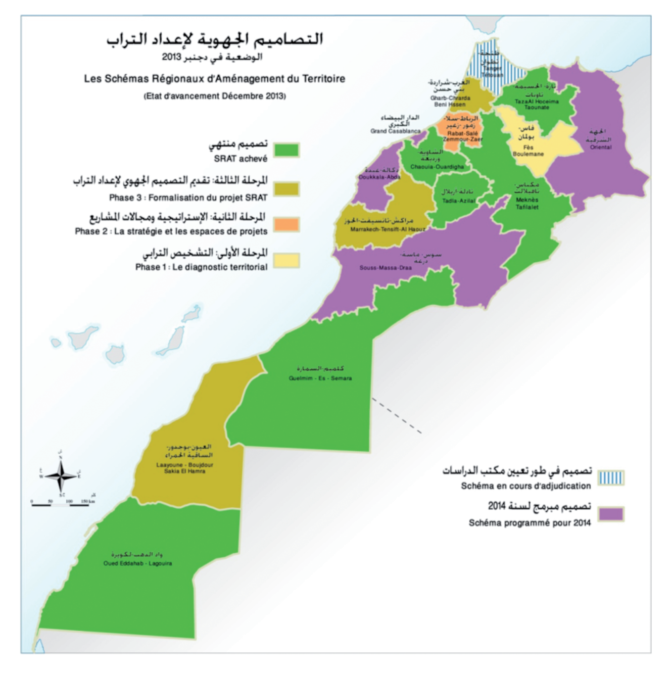
Figure 1 Progress Status of the Regional Territorial Planning Schemes (December 2013)