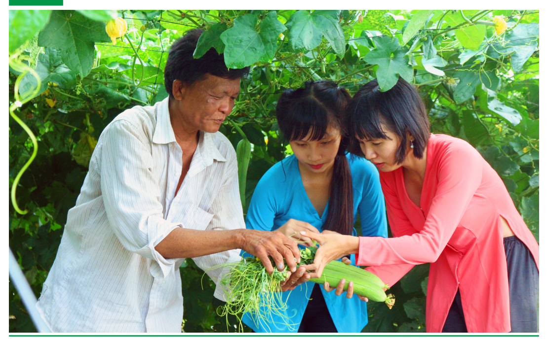
Figure 5 Urban agriculture expanded in major cities

The growth of the urban population and of its standard of living has raised demand for agricultural produce, particularly high-value products such as meat, fish, fruit, fresh vegetables and dairy products. Urban and peri-urban agriculture plays an important role in the urban food system. Peri-urban fruit production has grown rapidly, as farmers