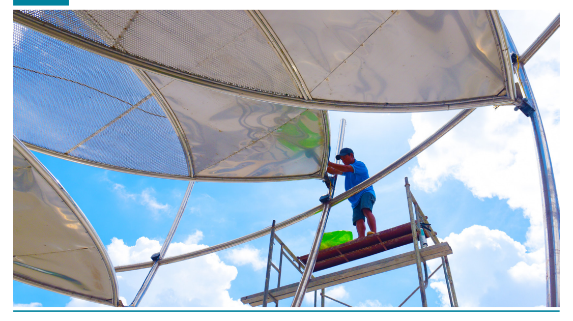
Figure 8 Preparing public lighting

In 2015, 95 per cent of the urban population had access to improved sanitation, while 5 per cent shared a sanitation facility and 1 per cent used another unimproved sanitation facility. This is a very significant improvement from the 1990 situation, when only 65 per cent of the urban households had access to an improved facility, 11 percent used an unimproved facility and 24 per cent of the urban households still practiced open defecation (JMP, 2015: 74). Regulations stipulate that all houses have to have some form of onsite wastewater treatment. Over 90 per cent of the households in large urban areas meet this requirement and have their toilet(s) connected to a septic tank. However, some septic tanks are not functioning properly or are not connected to a