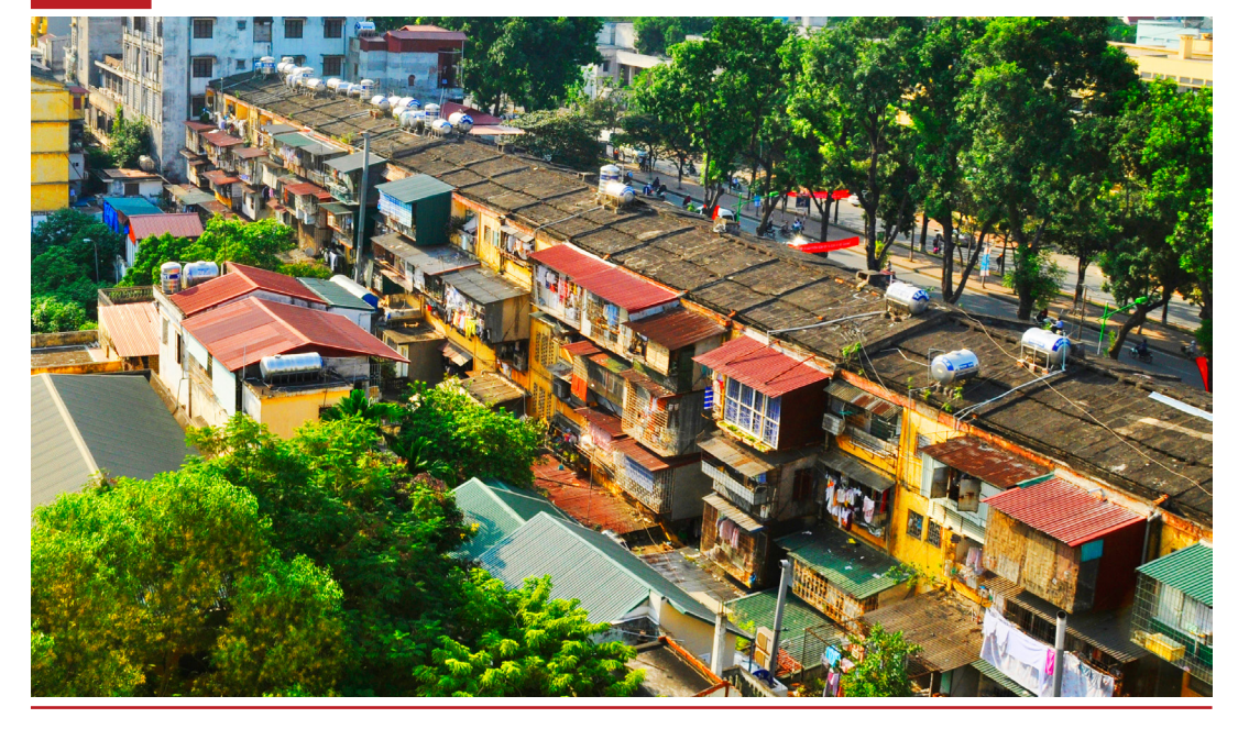
Figure 7 Existing old apartment block built from 1970s in Ha Noi

For resettlement housing, the city made land available and its architecture office produced the designs; actual construction was outsourced to state-owned enterprises. The preferred design was a high-rise building (G+5 to G+12) with apartments of 30-42 m<sup>2</sup>. Planners argued that high-rise buildings provide the required density due to the scarcity and high price of land. The apartments