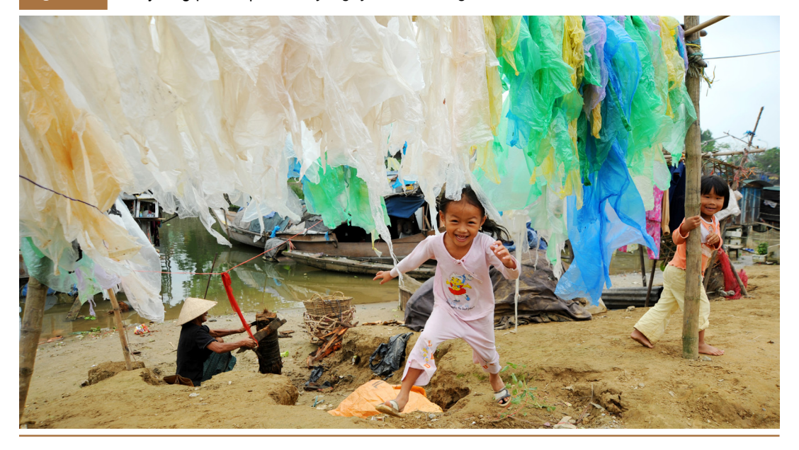
Figure 12 Recycling plastic

Viet Nam has the capacity to respond to the impacts of climate change due to its strong agricultural sector and its long tradition of dealing with natural disasters. The Government has adopted two policies directly related to climate change: The National Target Programme for Climate Change Response (2008) and the National Strategy for Climate Change Response (2011). The National Strategy calls for the establishment of a system to monitor and forecast climate change trends and its impacts in line with