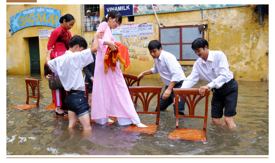
Figure 10 A wedding during Ha Noi's flood season

The Government stresses that harmony should prevail between population growth, urbanization, socio-economic development and environmental protection. However, despite significant achievements in environmental protection, the natural environment continues to deteriorate at a rapid and in some places at an alarming level. Rapid