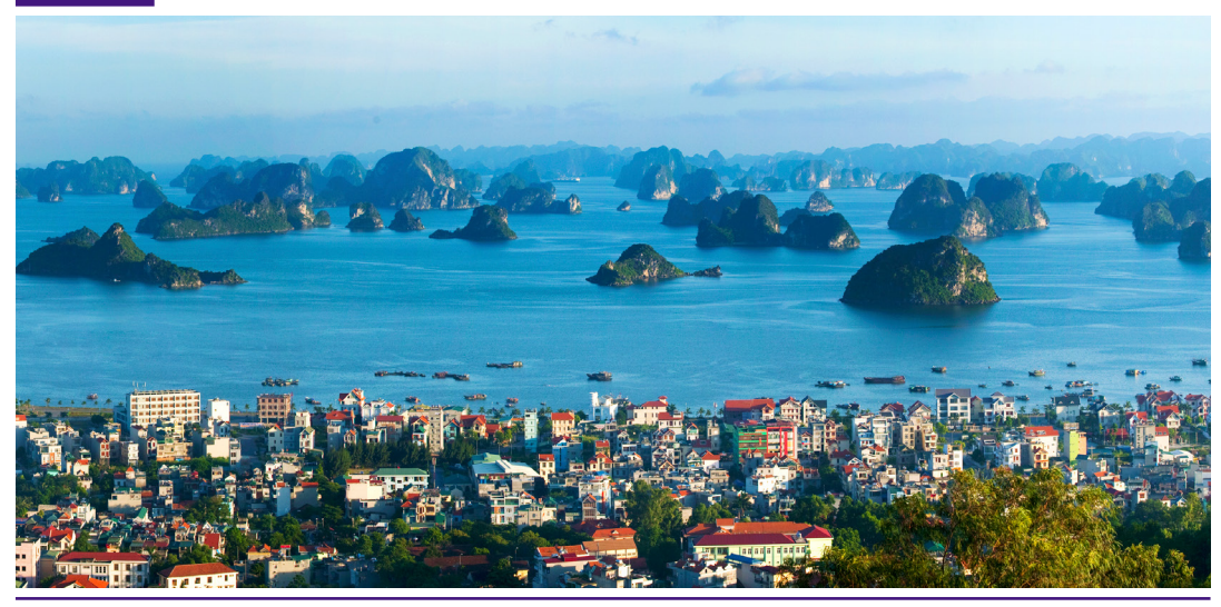
Figure 14 The harmony of urban development and natural beauty at Ha Long City

housing or to start a business. It is confronted with developments that do not conform to the plans and may be contrary to accepted norms of human Habitation, environmental concerns etc. Installing infrastructure becomes expensive after unplanned development, as land has to be acquired and households have to be resettled, while space for infrastructure is limited.