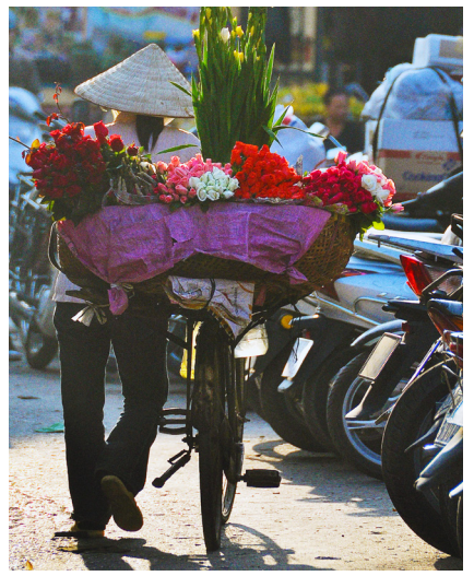
Figure 4 Informal micro business activity in urban areas