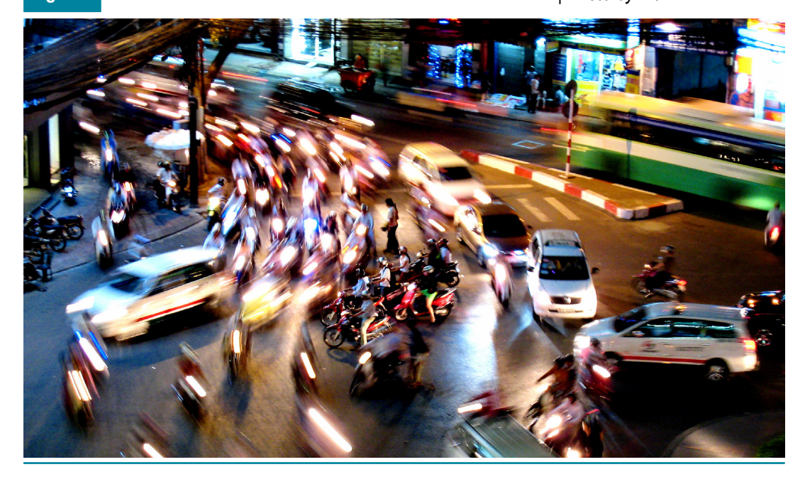
Figure 9 Motorbikes are still main vehicles used in cities in Viet Nam

Growing prosperity is enabling a growing number of urban households to shift from the motorcycle to the car. If this shift accelerates and the car becomes an important mode of transport, cities will face more traffic congestion, longer travel times and more air pollution, while urban road networks are incompatible with the demand for road space by private cars. Constructing new roads or expanding existing ones is mostly done on urban main traffic routes, but the traffic network at inter-regional level is still underinvested. The urban authorities