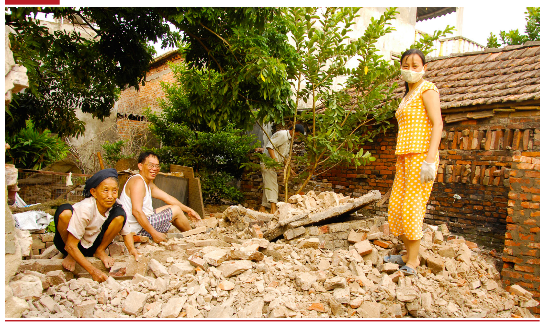
Figure 6 Family members participate in house building

home. The strategy sets the construction of 100 million m² of floor area annually as a target until 2020. At least 20 per cent of the floor area in urban housing projects will be set aside for beneficiaries of social assistance and low-income earners. The average floor area per capita in urban areas will increase from 19.2 m² in 2010 to 29 m² by 2020. Apartments will form a large share of the new housing, particularly in large cities, while rental houses will also be developed.