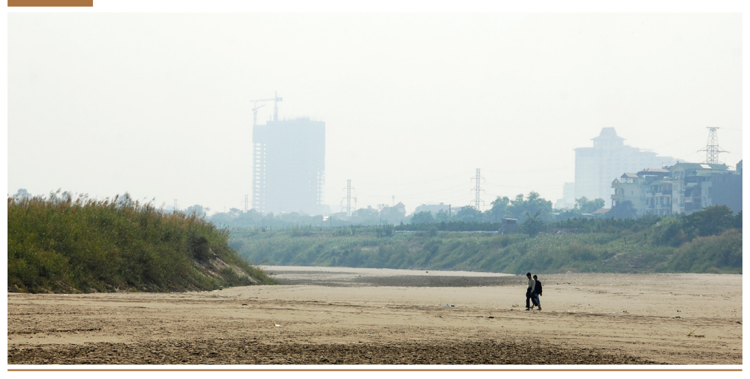
Figure 11 The Red River during draught

Linked to sea-level rise is saline intrusion or increased salinity which is most serious at the end of the dry season during the months of April to July. Due to low water levels in the rivers, high tide could push seawater inland, permeating farmland and reducing yields. Saline intrusion can cause changes in the aquatic eco-systems, damage infrastructure through corrosion and affect groundwater and urban water supply. In Hoi An, it already affects water supply, as water is primarily extracted from a shallow depth. During the dry season, water supply cannot operate 24 hours per day, with interruptions of up to 12 hours. Saline intrusion affects shallow underground water resources which people use when piped water supply is cut. Hoi An residents already reported a loss of rice yields of up to 50 per cent due to salinity (UN-Habitat, 2014: 16, 18).